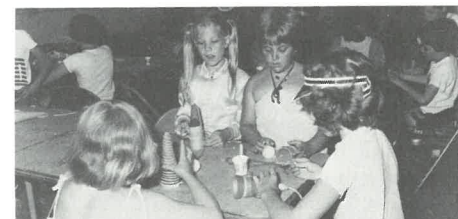
Arts and Crafts at Ingomar Elementary School

A winter program for exceptional children at Cumberland School is also provided by the Joint Recreation Board.