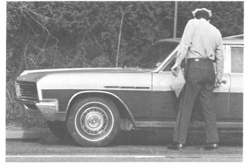
SPEED CHECK DETAIL